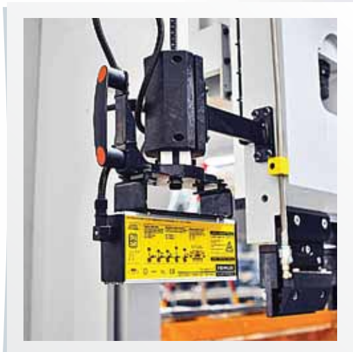
Fiessler Akas LCIM 2000 Protection System (O)