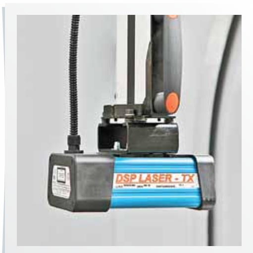
DSP Laser Protection (O)