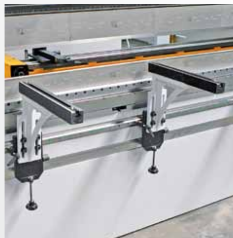
Sliding Front Support Arms (O)