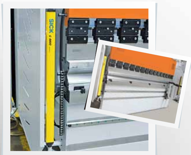
SICK Light Barrier (O)