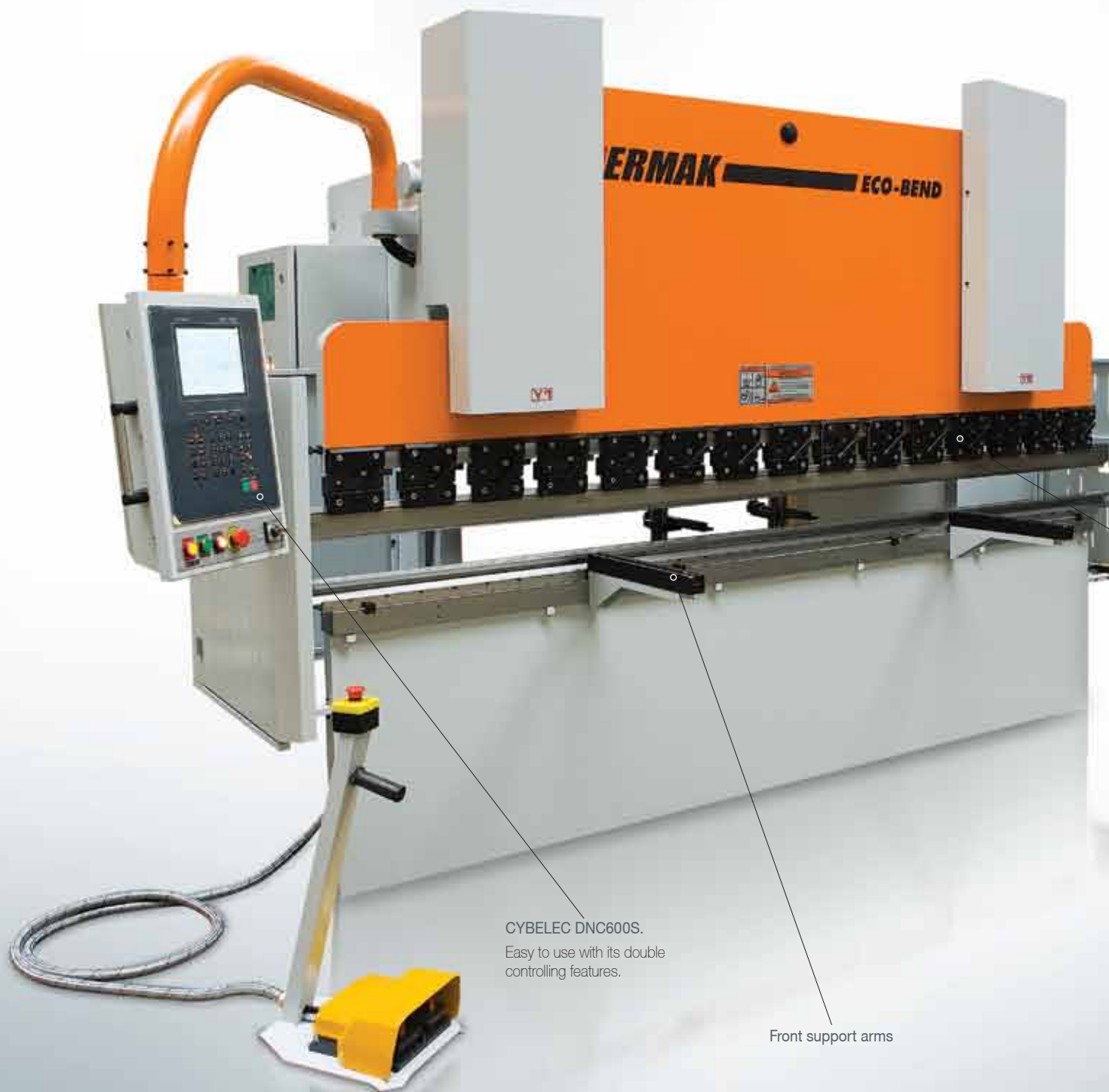
CYBELEC DNC600S. Easy to use with its double controlling features.

ERMAKSAN's world wide recognized machines designed by its experien- ced engineers, manufactu- red with high technological standarts and always offers its customers wide variety of products.