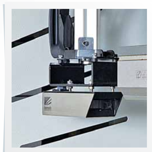
Laser Safe (O)

Laser safe is produced specifically for press brakes that is the leader among safety systems. Laser safe keeps the operator's safety at the top level.