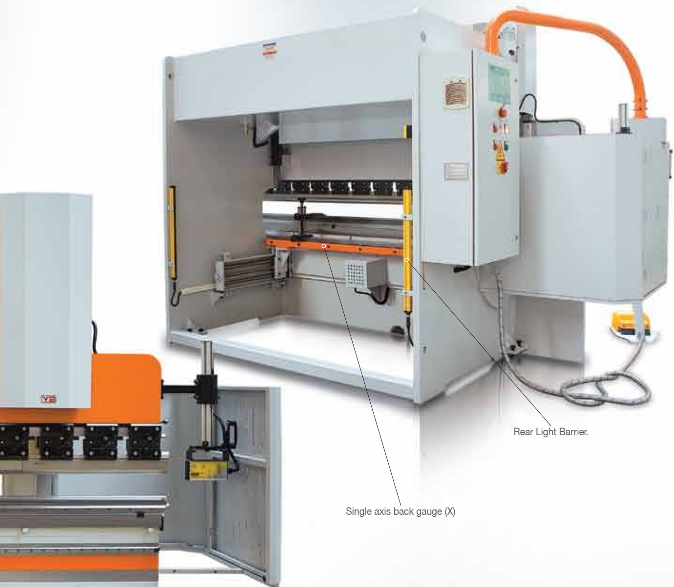
Rear Light Barrier.