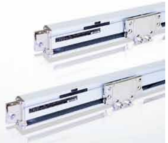
HEIDENHAIN and GIVI MISURE Linear Encoders