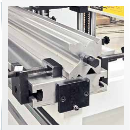
Multi-V Bottom Tool (O) Multi-V or U type adjustable tools.