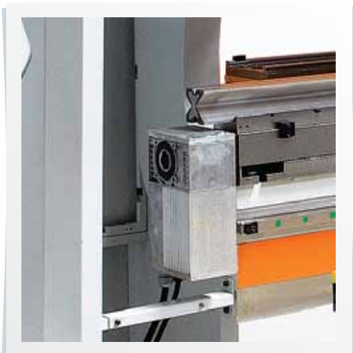
CNC Motorised Crowning System (O) CNC crowning system that communicates with the CNC controller, performs crowning automatically and enables the part to be at even bending angle at any given point.