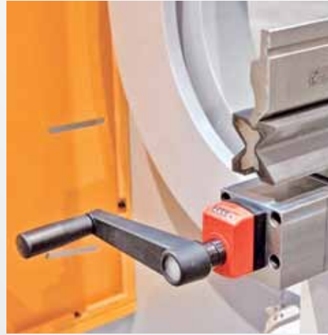
Manual Crowning System (O) Manual crowning system that enables the part to be at even bending angle at any given point.