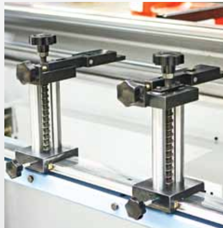
Backgauge Fingers (O) Specifically designed folding backgauge fingers.