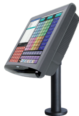
Pole mount option